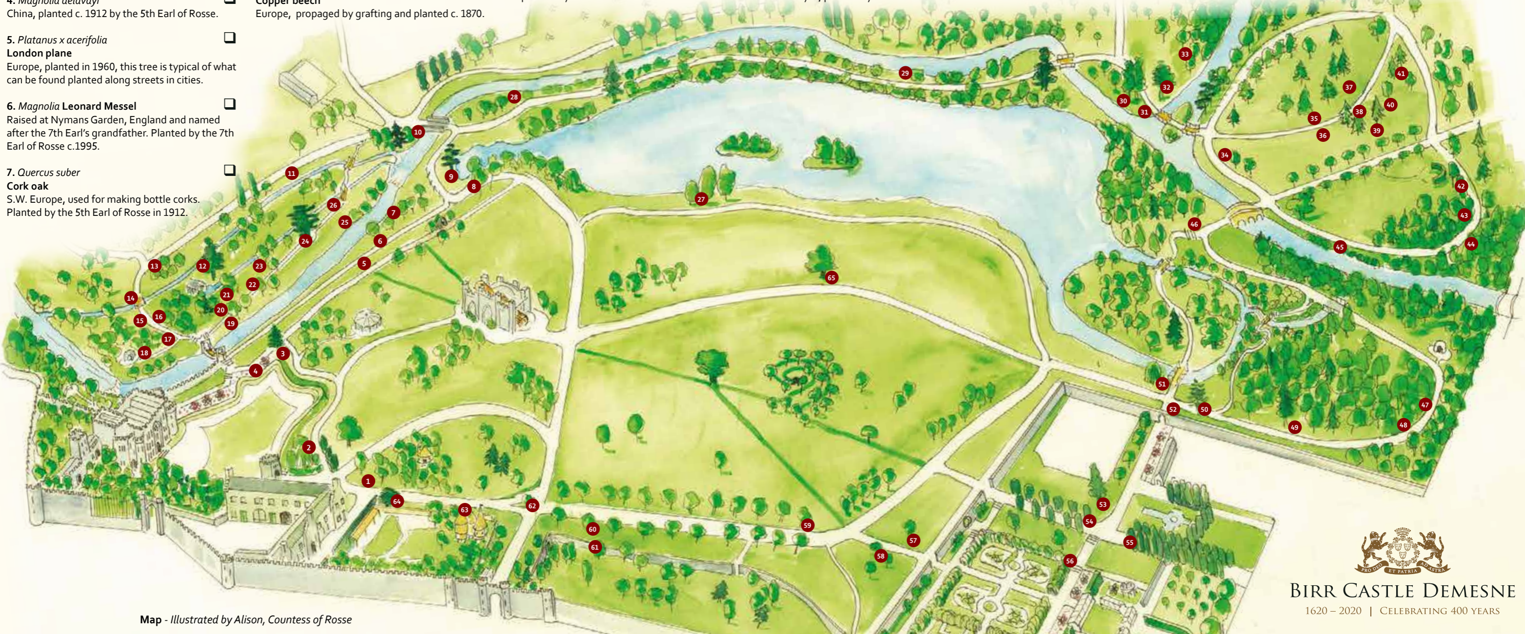
Map - Illustrated by Alison, Countess of Rosse

38. Thuja plicata Western red cedar America, believed to be over 100 years old.